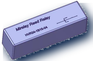
embedded pdf product render with exact hvr24 1b15 04 marking