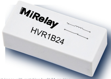
exact external product image with matching hvr1b24 marking