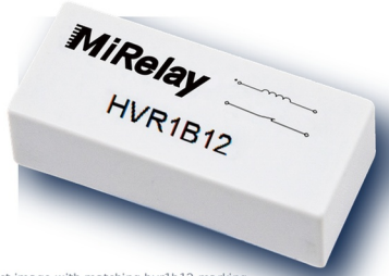
exact external product image with matching hvr1b12 marking