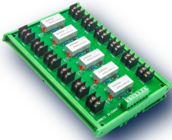
real hrm family product image from project library