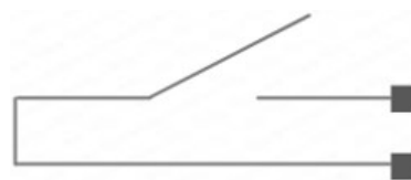
MRS08 PCB Layout